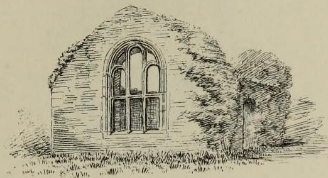
FIG. 1513.—Aytoun Church.

The old church is situated in an open burial-ground, in connection with which a new church was erected some years ago. The old building appears, from the remains of its ivy-covered walls, to have been of considerable extent, but no details can now be made out. The only portion which remains in a tolerable state of preservation appears to have formed a south aisle or wing.